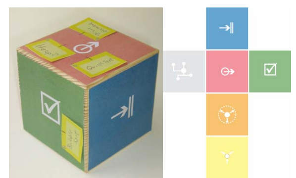
Figure 2. Learner Cube (left) and semantic types (right)

In addition to the semantic phases represented by the sides of the cube, digital paper Post-its can be attached to the sides of the cube (see Figure 2 left). This supports collaboratively collecting semantic items that are important and specific to this actual phase, e.g. relations to a specific learning content. Like Digital Paper Bookmarks, the Post-its are covered with Anoto pattern and can be labeled with a title.