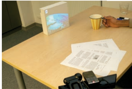
Figure 5. A photostream from Flickr is projected onto a box and can be navigated by rotating the coffee mug.