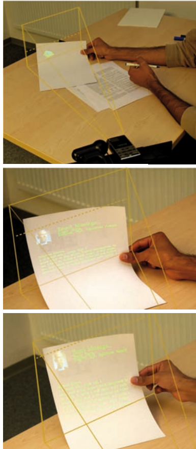
Figure 4. From top to bottom, levels of detail: (1) a small envelope is displayed due to the limited projection space. (2) By gradually lifting the paper, the level of detail is adjusted, (3) more text is displayed and automatically wrapped within the boundaries.