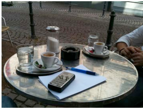
Figure 2. Example photographs from the two settings in the exploratory field study; personal desk (top) and café (bottom).