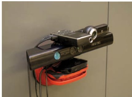
Figure 6. Hardware prototype using a Microsoft Kinect, mounted on a suction cup. The pico projector is placed on top of the Kinect. We have added a hi-res webcam on the right hand side.