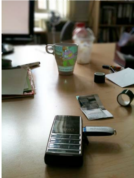
Figure 3. Scene from the session with P7: the interviewer deliberately projected a movie clip onto a cup on P7's personal desk. The interviewer first observed how the participant would react to this and then continued the interview process.

projecting into space without a target object and was able to display notifications, like on his Android smart phone. "By lifting a paper and moving it into the beam", he explained, "I can just take a look at my notifications, you know, to look if something is there ".