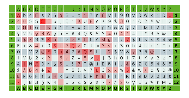
Figure 2: Heatmap of all the starting points chosen by the participants in our study.