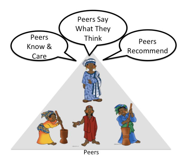
Figure 2: Societal Support

Case (2012) argues that too little research has focused on sharing of information between peers, and the fact that humans often avoid and ignore relevant information. Yet a literature review of peer-related security support does indeed show that many eminent researchers have started looking at this aspect of security. Rader et al. (2012) carried out a study to investigate how non-experts learn about security, and argue for the crucial role of the stories people tell each other in educating people about security. Ashenden & Lawrence (2013) also argue for a social marketing approach to achieve behavioural change, and Lipford & Zurko (2012) argue strongly for a social approach to security. Finally, Camp (2011) argues that usage of security software might have a tipping point, where a herd effect leads to adoption by a group of people.