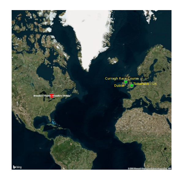
Figure 1: Example showing a geographical outlier: Breeder' Stakes (red, in Canada) and contextual entities located in Ireland and the UK (green).

In the standard EL setting, global inference is an NP-hard problem, since all combinations of all candidate entities of all mentions are considered simultaneously. In our proposed automatic verification setting, however, taking only the top candidate entities into account allows us to employ knowledge-rich, global coherence features that would be prohibitively expensive otherwise.